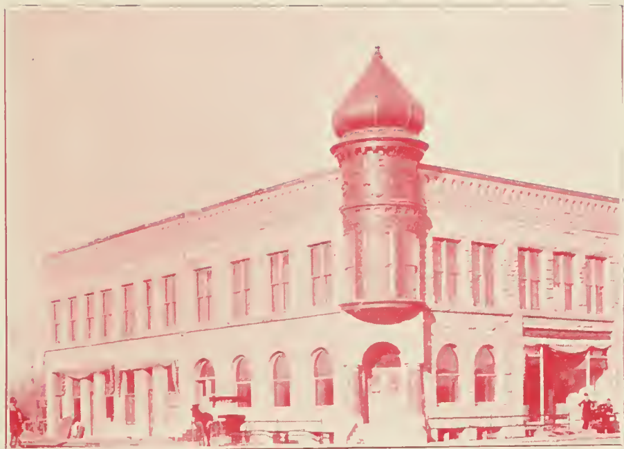
The I. O. O. F. and A. O. U. W. Block, Belleville, Kans.